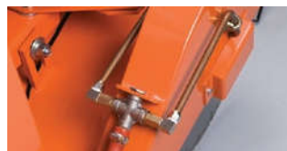
WATER ON BOTH SIDES OF THE BLADE