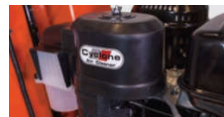
CYCLONIC AIR FILTER