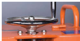
HANDWHEEL WITH ENDLESS SCREW DEPTH CONTROL SYSTEM